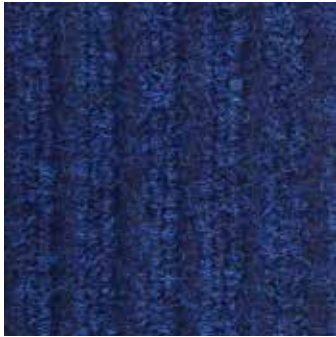
deep sea 5038