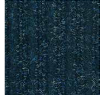
blue ocean 5018