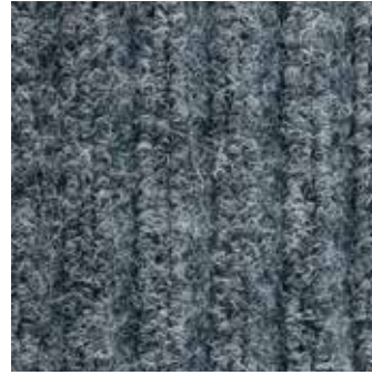
sea spray 5085