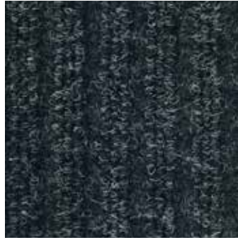
coral reef 2236