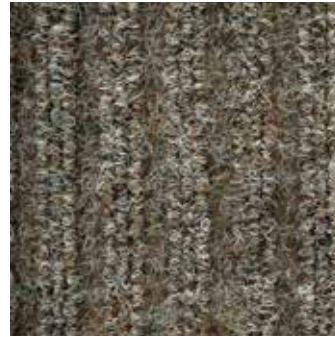
pebble beach 7011