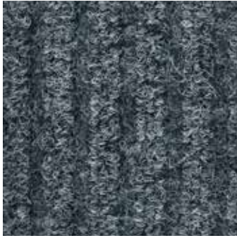
stormy water 2081