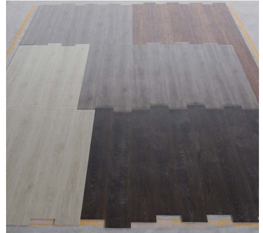
Test specimen, planks on concrete floor.