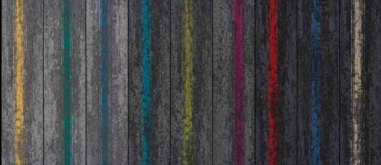
CONNECT ZINC YELLOW 6-082-003PL CONNECT ZINC TEAL 6-046-021PL CONNECT ZINC AZURE 6-040-036PL CONNECT LEAD AQUA 2-021-031PL CONNECT LEAD GREEN 2-048-002PL CONNECT LEAD MAGENTA 2-060-062PL CONNECT CARBON RED 1-023-035PL CONNECT CARBON NAVY 1-019-040PL CONNECT CARBON SAND 1-007-099PL