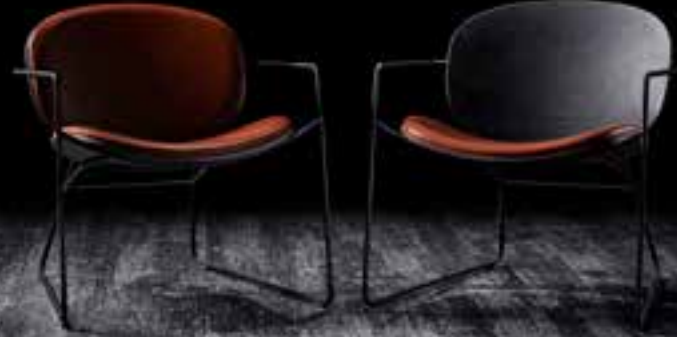
CORE lead 2-000-000PL