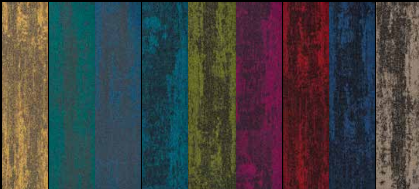
COMPOUND ZINC YELLOW 6-082-003PL COMPOUND ZINC TEAL 6-046-021PL COMPOUND ZINC AZURE 6-040-036PL COMPOUND LEAD AQUA 2-021-031PL COMPOUND LEAD GREEN 2-048-002PL COMPOUND LEAD MAGENTA 2-060-062PL COMPOUND CARBON RED 1-023-035PL COMPOUND CARBON NAVY 1-019-040PL COMPOUND CARBON SAND 1-007-099PL

construction yarn/fibre pile weight pile height gauge tile size total thickness carton size total weight dimensional stability backing electrostatic propensity fire rating ISO 9239 1 recommended adhesive installation method