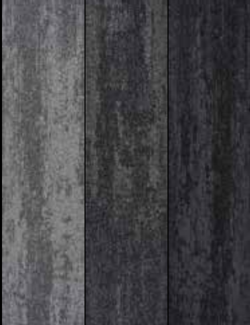
CORE ZINC 6-000-000PL CORE LEAD 2-000-000PL CORE CARBON 1-000-000PL

Width of colour stripe varies across planks.